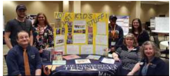
Third Place: Paul Meek Library