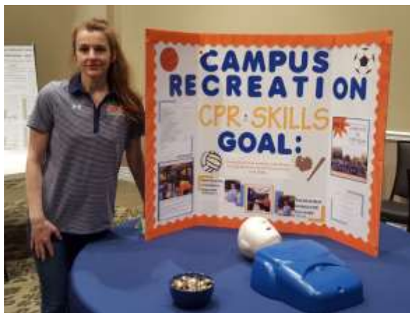
First Place: Office of Campus Recreation