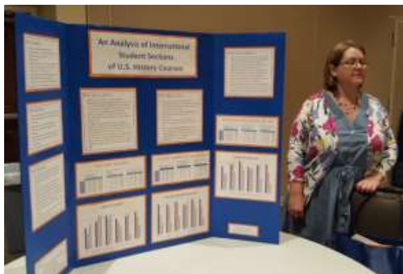
First Place: Department of History and Philosophy